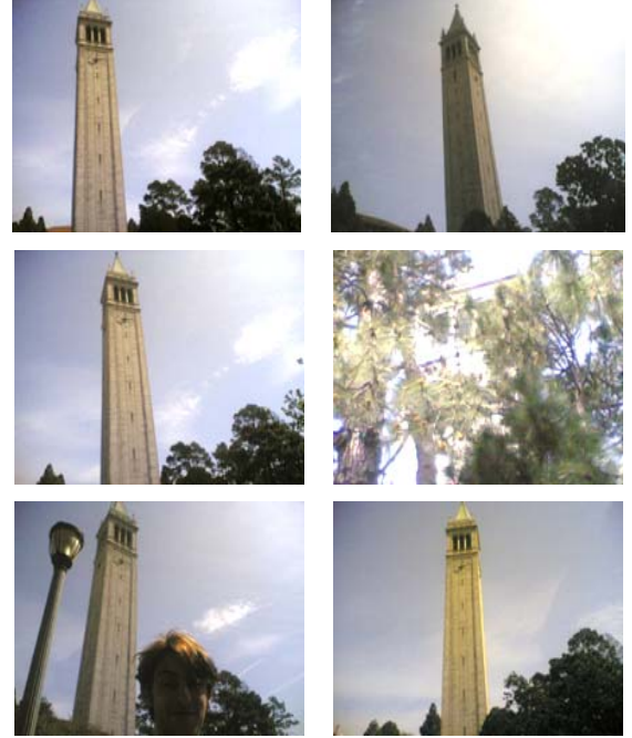
Figure 2. Visual sub cluster example corresponding to an exemplar (first image).

Color histograms are used as an alternative similarity measure with which to compare the performance of the CVA algorithm.