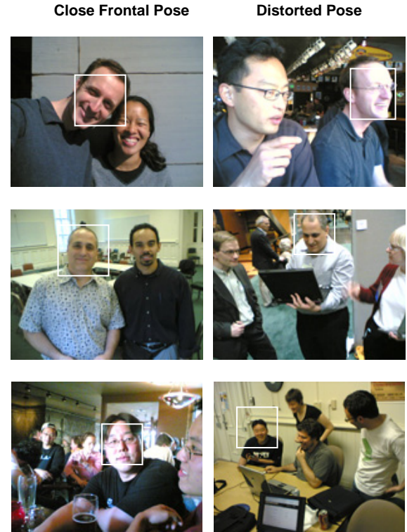
Figure 1. (Left) Subjects with frontal pose, (Right) Same subjects with non-frontal or distorted pose.

To create a set of photos annotated with labeled faces we used a custom-built Java applet that can be accessed on the web, linked from the MMM2 website. The applet allows a user to select a region of a photo and associate a person’s name with this region. Selecting a region associated with each face rather than simply a single point with the face allows this metadata to be used for face detection as well as recognition. Users were instructed to select regions of the photo containing faces (from ear to ear, forehead to chin), which were at least 20-30 pixels wide and in which the face is visible enough for the human annotator to recognize it. In an effort to create a dense set of annotated photos in which many faces appear many times, rather than a sparse set in which many faces appear only a few times, we had several MMM2 users (primarily from the development team) use this annotation tool to annotate as many photos as possible.